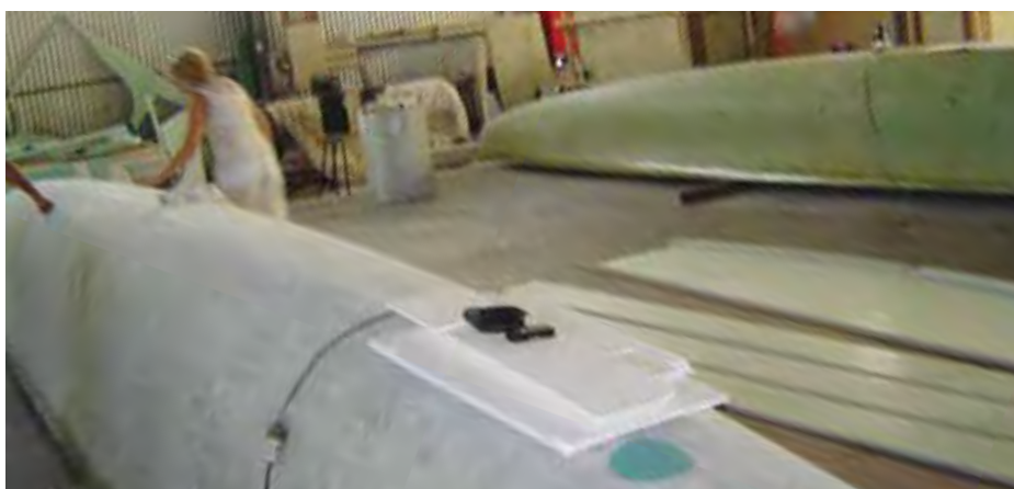
Very quickly it's a 40 footer again. (top left) Our rack puts everything in one place. (top right) Painting not fairing. Hull shoes arrive quite fair, straight from the mold. (above)

from Multihull World mag. Or go to our website at www.australiancompositepanels.com.au for a combined version of those stories as well as a look at our study plans and extracts from the actual plans. Be patient loading the PDFs as they are quite large.