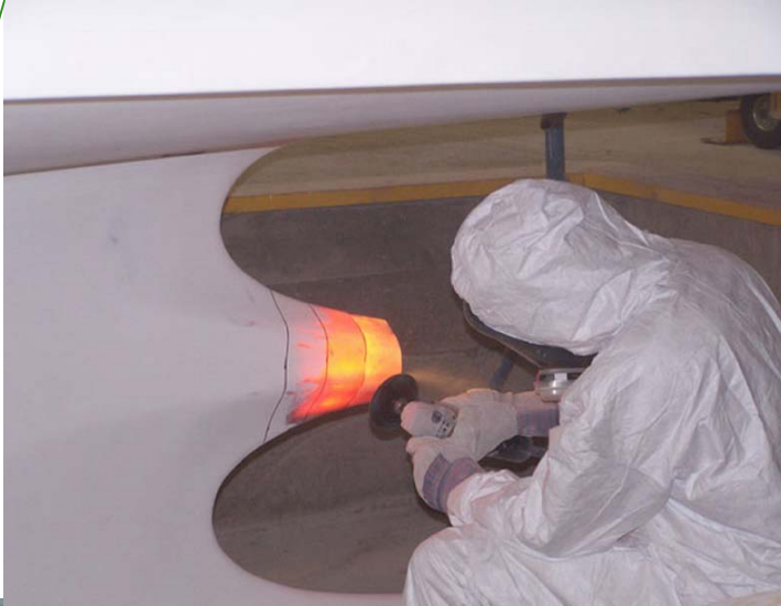
Sample shaft tube exit