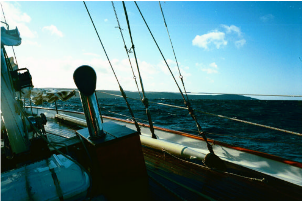
Sailing in Newfoundland. Note the integral deck boxes and tall Dorade ventilators.