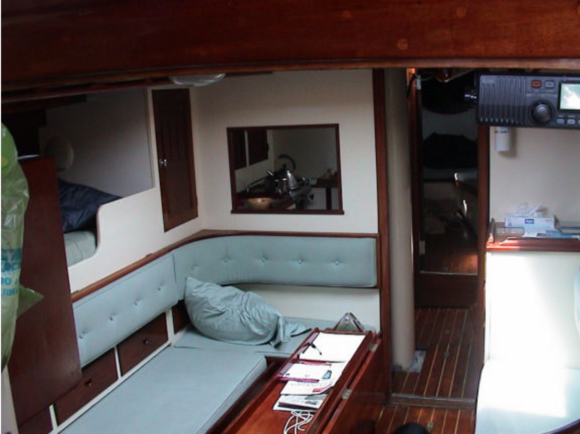
Main cabin looking forward.

Down below, Impala was built as a luxury (1950's style) cruiser. She has a beautiful owner's cabin aft with a double and a single berth, chart table and head at the companion, a main saloon with outboard pilot berths amidships, and her galley forward. The fo'castle has a good bunk and extra storage for sails and the galley. The forepeak holds the anchors and rode.