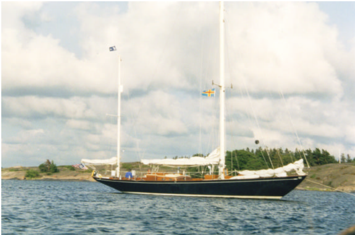
Impala has cruised extensively in the Baltic. Here she is anchored near Mariehamn, Åland Islands.

Impala is a tribute to the CCA rule and its traditions. She is a seaworthy and comfortable ocean cruiser. In aggressive hands she can win races. She is easy to sail, fast, and everything works. And she brings joy to people who like looking at pretty boats.