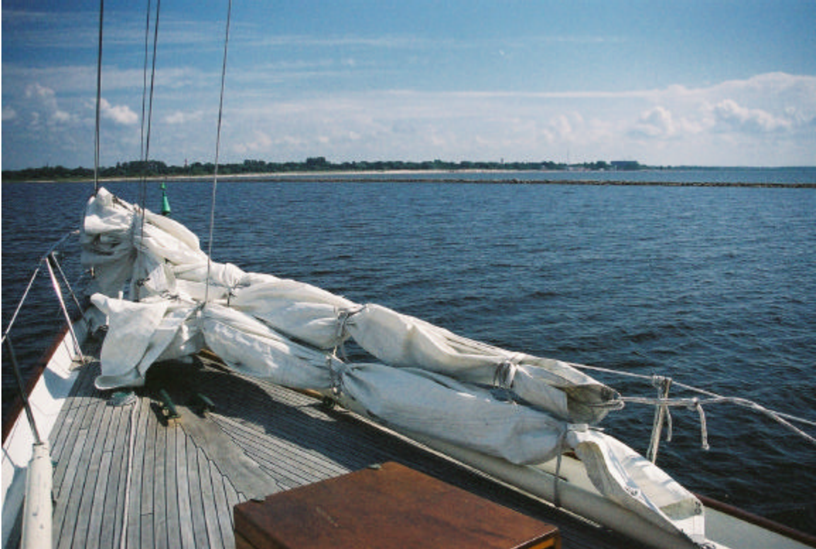
View of the foredeck with headsails furling to the lifelines