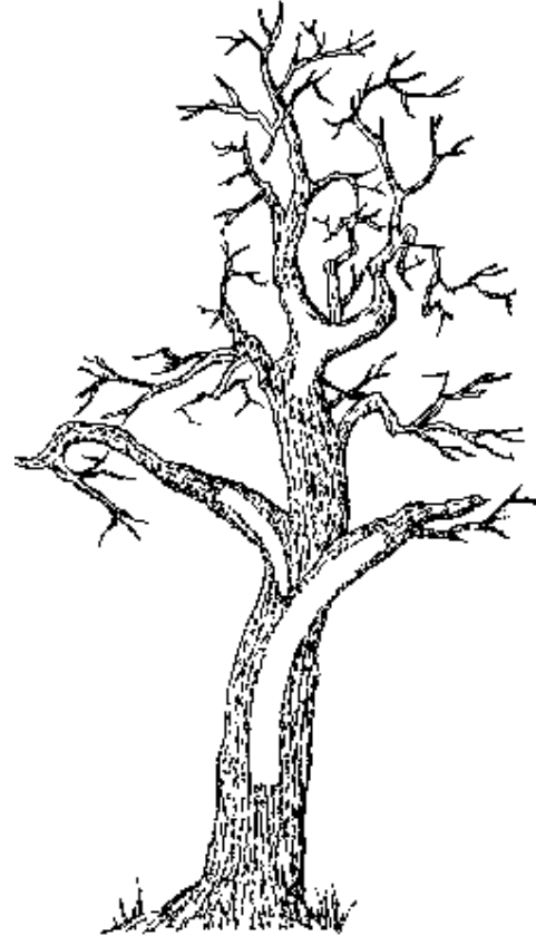
Similar components to be selected from another more twisted and irregular Oak tree.