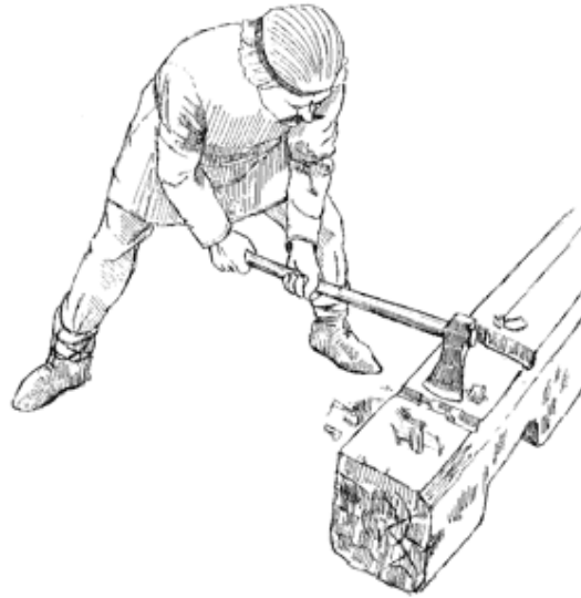
Squared logs rebated to go over ribs in the ship using just a axe.